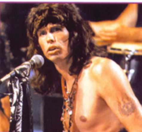
The lush-lipped rocker performed shirtless in 1990.